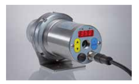
CellaTemp® PA Series

Versatile pyrometers with focusable lens, through-the-lens sighting/laser spotlight or video camera.