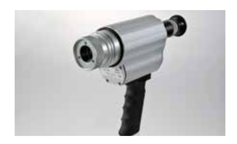
CellaPort PT Series

Versatile fiber optics pyrometers with focusable head and laser spotlight.