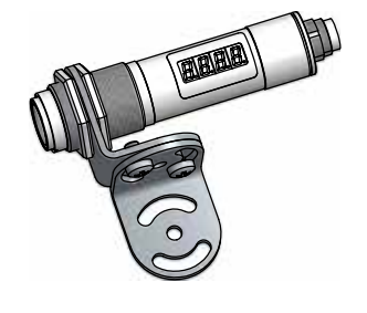
Mounting angle PS 11/U