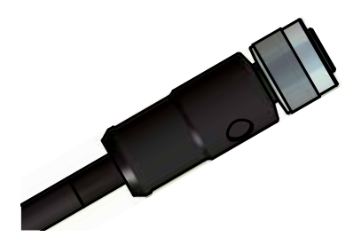
Shielded cable VK 02/L AF 1: 5 m VK 02/L AF 2: 10 m