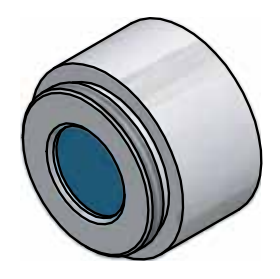
Supplementary lens PK 11/E AF 1