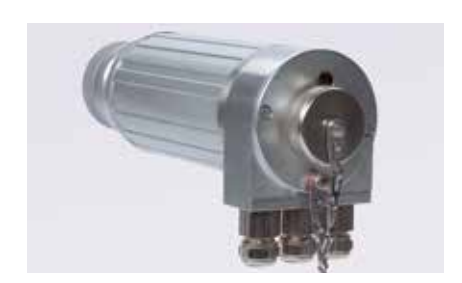
CellaTemp® PZ Series

Profibus pyrometers with focusable lens, through the lens sighting or laser spotlight.