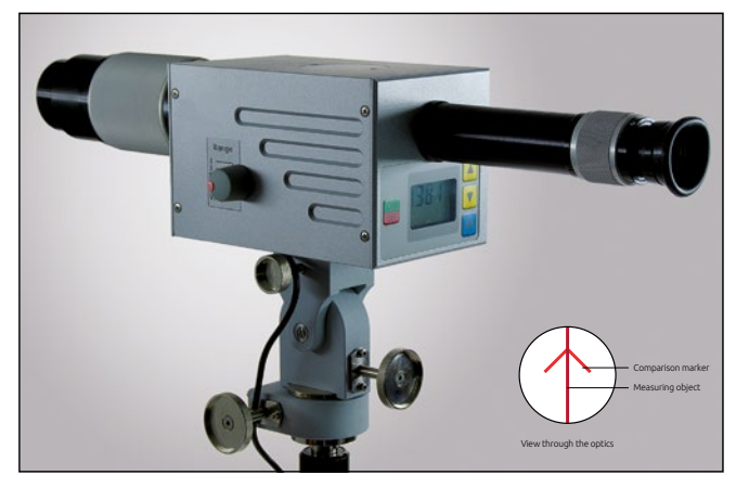
Fig. 3 Intensity comparison pyrometer PV 11 for precise visual temperature measurement.

emissivity tends to increase with temperature, this comparison measurement should always be performed at higher temperatures