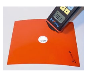
Fig. 2 Determine emissivity by comparison measurement on emission adhesive tape with defined emissivity.

First, the true object temperature is determined at the sticker spot ( Fig. 2 ). Then a comparison measurement is performed at the object right next to the sticker. Subsequently, the pyrometer's emissivity is adjusted so that the instrument displays the prior temperature reading. Because the influence of