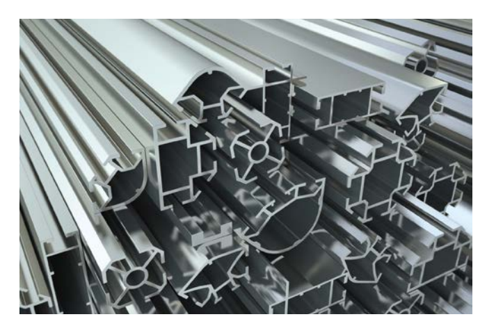
Fig. 3 The profile of the aluminium can influence the infrared temperature measurement.

In the 1980s, multi-channel pyrometers were developed to compensate for emissivity-related and profile-dependent interferences, which recorded infrared radiation at up to 4 wave-