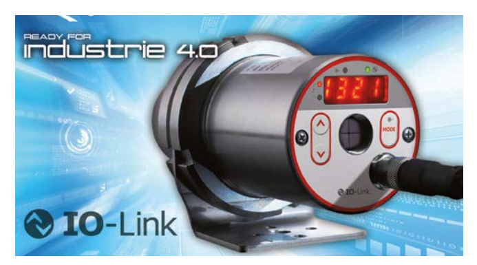
Fig. 4 CellaTemp PX 69 pyrometer with new EERC algorithm and modern IO-Link communication interface

A reference measurement using a penetration thermometer determines the value of the new EERC parameter to be set. As with previous infrared measuring methods, it is still necessary to determine the value per profile for different strand geometries. The values are stored in the control system and transmitted to the devices via the modern IO-Link communication interface when the profile is changed.