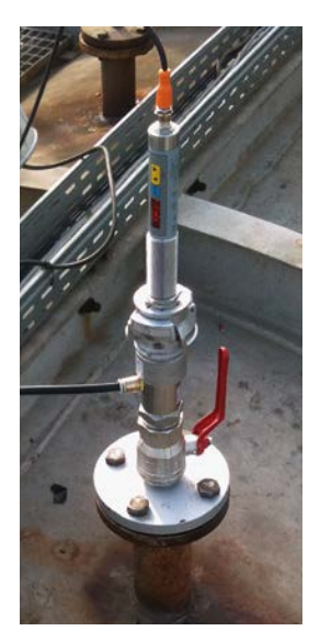
Pyrometer CellaTemp<sup>®</sup> PK with mounting

In today's international competition, a manufacturer of heavy clay products or refractories is forced to deal permanently with the reduction of production costs and the increasement of the efficiency of the production plant.