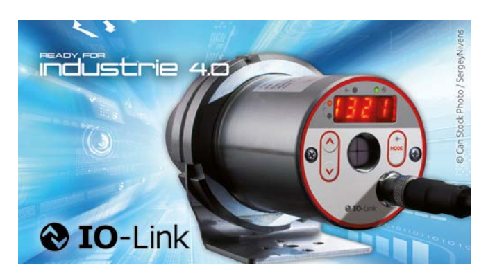
CellaTemp® PX 40 two-colour pyrometer with through-the-lens sighting and focusable optics

method and a very short measuring time, the software algorithm of the CSD function in the pyrometer is able to filter out especially the measured values of the scale and oxide free surface. The higher the quality of the optics and the higher the optical resolution, i.e. the smaller the pyrometer's measuring field, the more likely the pyrometer is to detect small hot spots. While the rolled material passes the pyrometer, the true temperature at the clean spots is automatically measured and indicated by means of the CSD function.