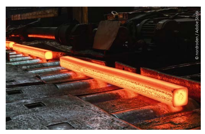
Scale and oxide significantly change the radiation properties

Scaling and oxidation on the surface of the rolled material have a considerable influence on the measuring accuracy of optical temperature measurement in rolling processes. Consequently, the emissivity, i.e. the radiation ability of the rolled material, changes extremely. However, a scaled surface has a higher emissivity compared to a scalefree surface. Depending on the absolute temperature values, a conventional pyrometer may give a higher reading than at the scale-free location, even at a lower temperature of the scale.