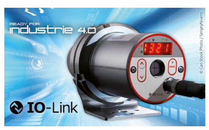
CellaTemp® PX 40 two-colour pyrometer with through-the-lens sighting and focusable optics

In order to minimise the interfering influence of the scale and oxide on the measurement, the so-called CSD function (Clean Surface Detection) was developed. Based on the two-colour measuring method and a very short measuring time, the software algorithm of the CSD function in the pyrometer is able to filter out especially the measured values of the scale and oxide free surface. The higher the quality of the optics and the higher the optical resolution, i.e. the smaller the pyrometer's measuring field, the more likely the pyrometer is to detect small hot spots. While the rolled material passes the pyrometer, the true temperature at the clean spots is automatically measured and indicated by means of the CSD function.