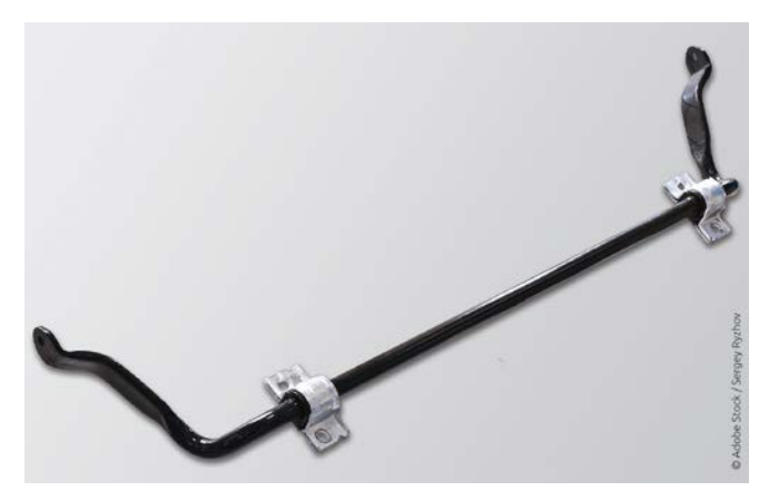
Fig. 1 Chassis stabilizer of an automobile

A stabilizer is a multi-bent metal tube of the chassis of each automobile. It connects the wheel suspension of the two wheels of an axle with each other as well as with the car body. The task of this spring element is to prevent uneven swinging and rolling of the two opposite wheels when taking curves, on slopes or uneven surfaces and to transmit the movement to the entire chassis. Without the stabilizer, a car would tip over in a curve. It therefore contributes significantly to driving safety and driving comfort ( Fig. 1 ).