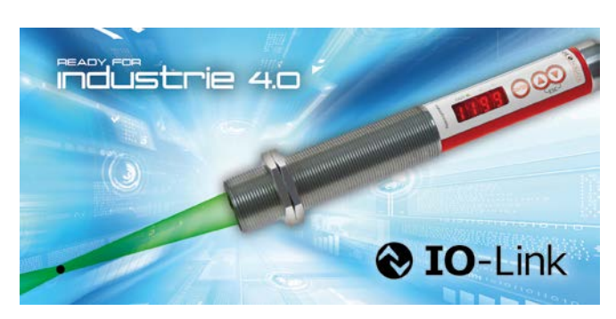
Fig. 3 Modern two-colour pyrometer with LED pilot light and IO-Link interface

Since pyrometric temperature measurement is an optical measuring method, the surface and the material have a direct influence on the radiation property and therefore on the measured temperature. Therefore, when commissioning a single-colour pyrometer, the emissivity of the measured object must be set. This always raises the question of the correct emissivity under the given measuring conditions. If possible, this is determined by a comparative measurement using a contact thermometer. Single-colour pyrometers react immediately with a false indication, if the emissivity has not been set correctly or varies from tube to tube. The algorithm of the two-colour measurement has the advantage that the influence of the emissivity will compensate to a certain degree. Therefore, no correction is necessary when using two-colour pyrometers to measure the metallic tube in the induction coil.